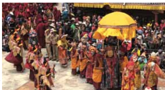
Photos: Above - Raft Race scene of mayhem. Right: Hemis Festival monastery crowds; Festival procession; young monks gambling.

I suspect that the scoring for the entries yesterday might be influenced by how much the audience were interested in the subject as much as by the production quality or technical complexity. I suppose the challenge is to inspire interest where none existed before!"