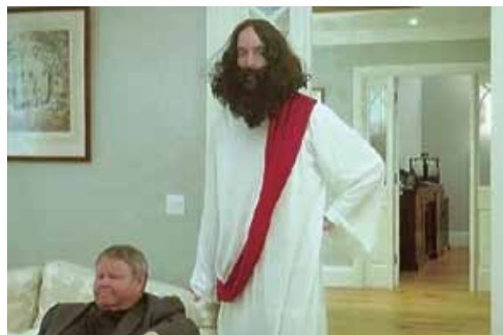
Lost in Translation was the popular winning entry by the club audience vote.

All had a lot of fun making their films and it is a shame that just three could manage it. By renaming the competition Film in Four from Movie in a Month and previously Film in an Evening , each group had four months to create their masterpiece, but when it comes down to it, even getting together for one day is a challenge. As it was, the Oddbods were shooting theirs on the day of the BAFTA show and arrived at the club somewhat frazzled.