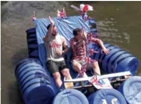
Photos down the page from left to right: Raft portorage nearly put one boy in the drink. A more compact raft carried over the foot bridge. The busy preparation area. Lions ladies line up. Guildford's Mayor, gets in on the act. Dad's Army - they don't like it up 'em! Start - and they're off, well the Mystery Machine is. Baywatch and Cask Aways vie for position. Chaotic scenes at the start. Across the bottom: A daring launch from a high bank for an unusual folding raft - well maybe it wasn't at first! Seems okay going under the bridge with a cheery wave .... more on this one, over .....