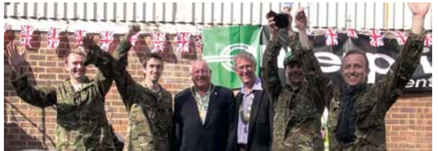
Photos down the page from left to right: ..... Folding raft with that sinking feeling! The Flintstones car raft heading down to Bedrock. The bankside bombardment - just look at the aggression of the kid with the green water gun! Pirates of The Black Pearl soaking a competitor. Mayor getting a wetting? Rather pallid Smurfs, having been washed of their blueness. The best investment I made - HiViz jackets helped us barge in. Dad's Army receive their Cup for 'Best Decorated Raft'