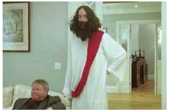
Lost in Translation was the popular winning entry by the club audience vote.

All had a lot of fun making their films and it is a shame that just three could manage it. By renaming the competition Film in Four from Movie in a Month and previously Film in an Evening , each group had four months to create their masterpiece, but when it comes down to it, even getting together for one day is a challenge. As it was, the Oddbods were shooting theirs on the day of the BAFTA show and arrived at the club somewhat frazzled.