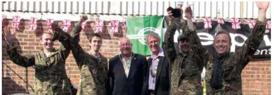
Photos down the page from left to right: ..... Folding raft with that sinking feeling! The Flintstones car raft heading down to Bedrock. The bankside bombardment - just look at the aggression of the kid with the green water gun! Pirates of The Black Pearl soaking a competitor. Mayor getting a wetting? Rather pallid Smurfs, having been washed of their blueness. The best investment I made - HiViz jackets helped us barge in. Dad's Army receive their Cup for 'Best Decorated Raft'