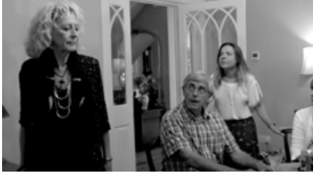
A scary moment when Alice enters