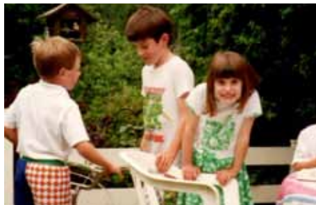
It's a family film so the Grandchildren are essential