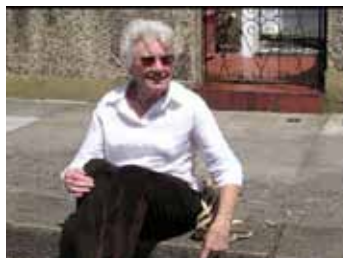
Dave's Mum recalled playing Dabs sitting on this very kerb nearly 100 years ago