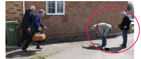
You might well arsk what's going on here