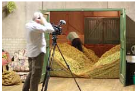
Filming at the Hogs Back Brewery