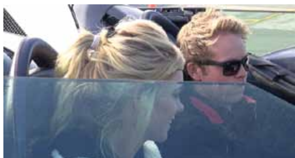
Above: Explaining the controls, the McLaren test driver was the cheekiest of her instructors