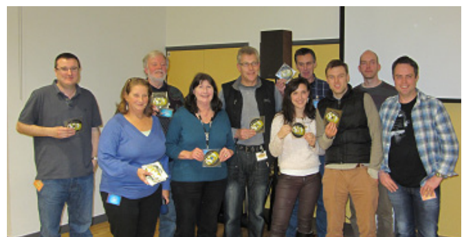
Some of the Cast & Crew of "Frequency Hertz"