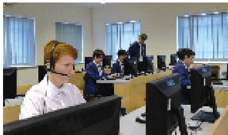
The meeting room

With a massive £0 budget, it's an action movie in which the Government has had secret documents stolen from them and they are out to retrieve them. Six boys are involved in the action, while Ollie is masterminding the production, directing and filming on a Lumix GH2 and using a Rode videomic Pro for sound capture.