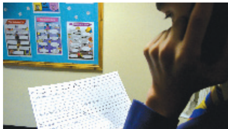
The missing secret documents