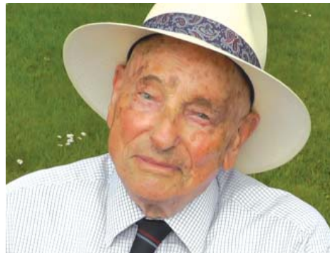
Sir Paul Holden

With nothing more than my Panasonic palm-sized camcorder, no script or shooting plan, I ventured over to Clare Park to record 'Eight Decades of Film Making'. It was completed over an afternoon last June, with the usual problem of wind noise, and frustratingly several episodes of loss