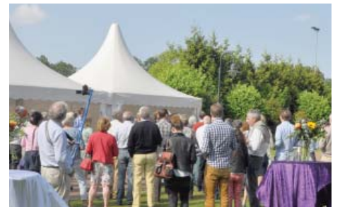
Mini jib in use over the crowds

Later, during meal time announcements and entertainment, I had to employ the zip-panning technique, camera panning madness, so as to pick out guests