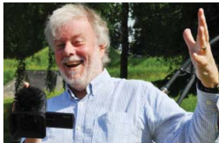
Yours truly clearly enjoying both party and filming!

There were complications for me as sole camera and sound man, as I soon found out. The first was that all the guests rather inconveniently spoke in Dutch (not unreasonable, since it was in Holland) but it meant that I wasn't able to follow conversation breaks easily - vital with sound so that you don't chop