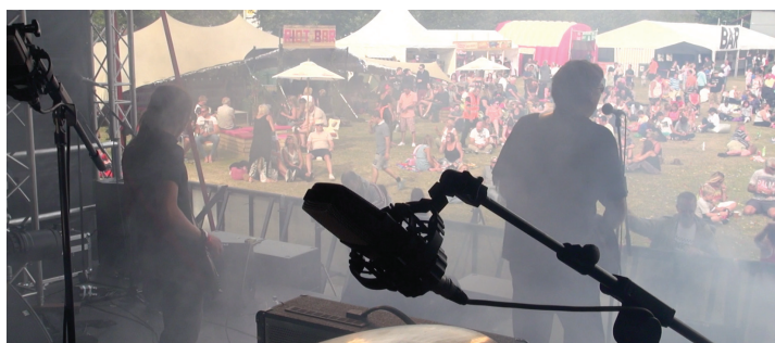
Performers' eye view