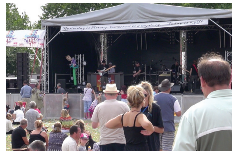
The main stage

Performing at music festivals, events and venues around the country