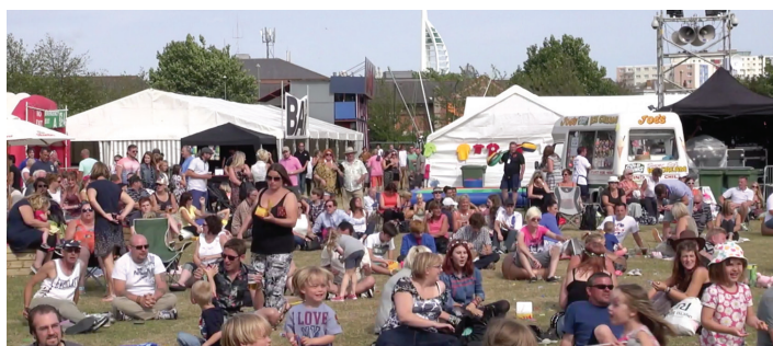
A family gathering with sun, musical entertainment, funfair and plenty of food stalls - the Spinnaker Tower in the background.