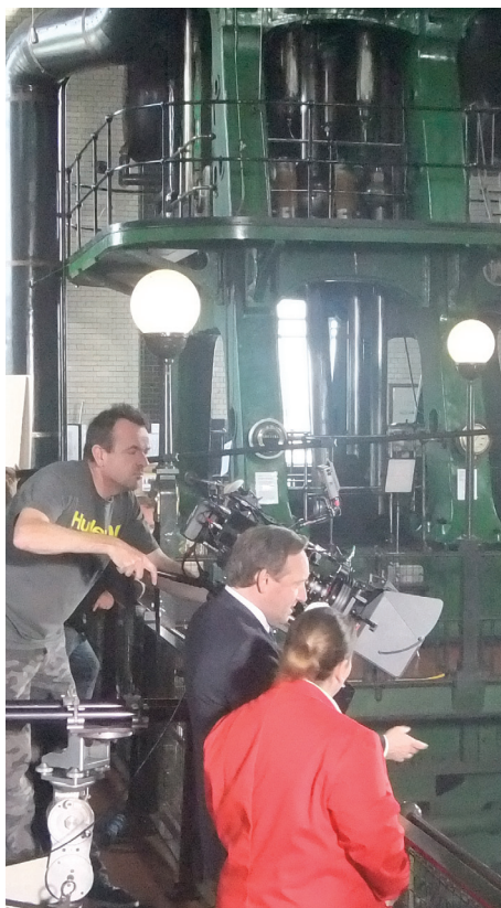
Neil Dugeon as DCI John Barnaby in 'Midsomer Murders' when the museum was dressed to represent a biscuit factory

ACTION, FICTION MUSICAL DOCUMENTARY COMMERCIAL