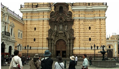
Photo scenes of Peru

Altogether a good entertaining selection of films enjoyed and reviewed by the SBMM members